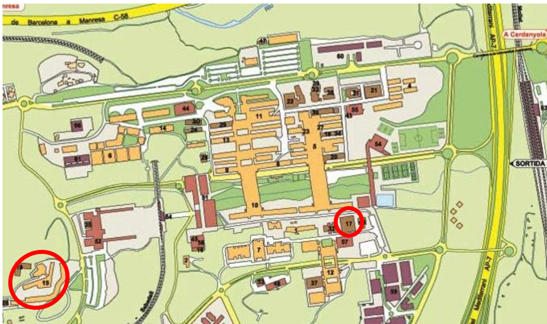
Campus UAB ( www.uab.es ): 15. Veterinary School; 17. CBATEG